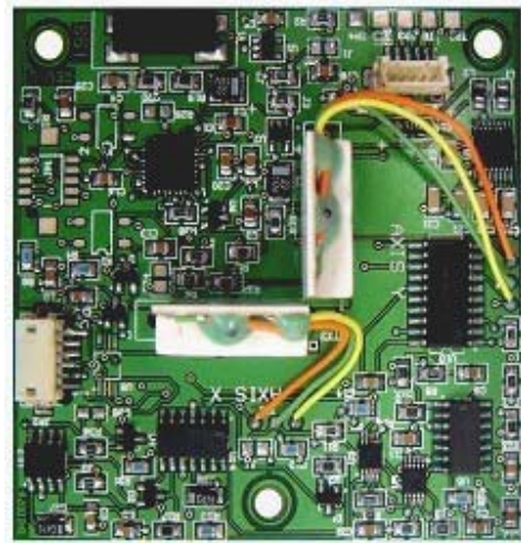
*Shown with two SH Series Ceramic Sensors installed (not included).