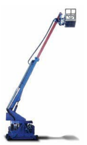
Telescopic Boom Lift

This gives us three distinct applications for an inclinometer and/or tilt sensor;