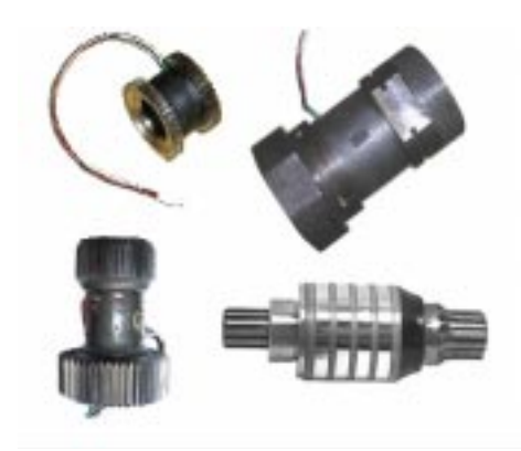
Nut Runner Transducer repairs