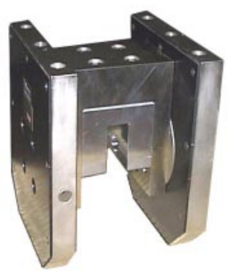
Tandem mounted torque sensors